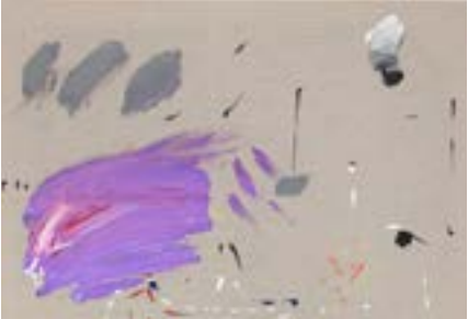
Llegando desde México, 2021

Acrylic on canvas 59.4 x 84.1 x 4 cm (23.39 x 33.11 x 1.57 in.)