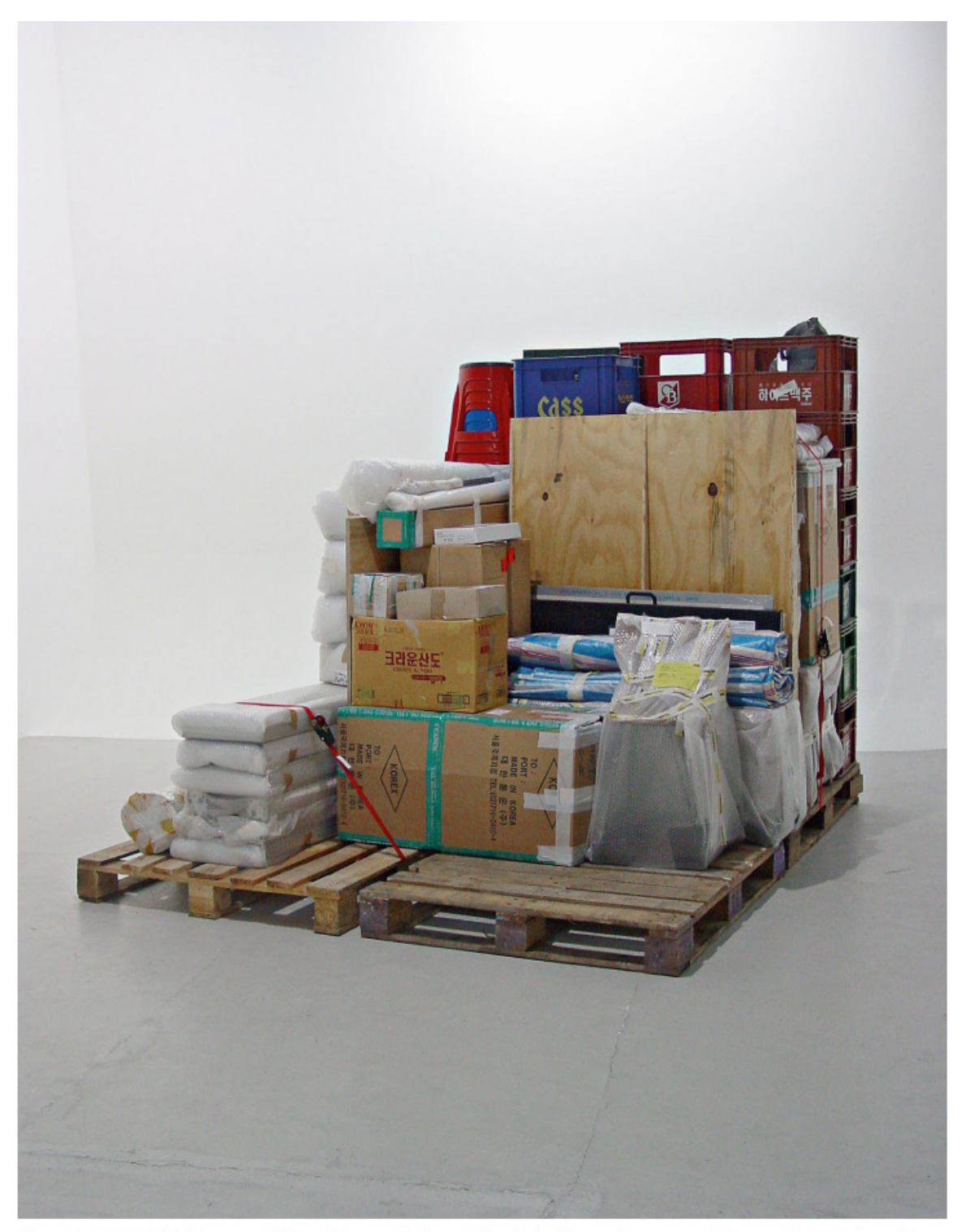
Yang's 2004 "Storage Piece," a sculptural installation of some of her older artworks that have been wrapped and stacked. Haegue Yang, "Storage Piece," 2004, installation view, wrapped and stacked art works, Euro pallets, dimensions variable, Haubrok Collection, Berlin