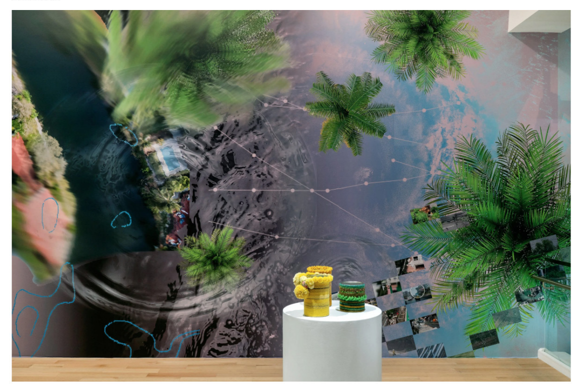
An installation view of "Haegue Yang: In the Cone of Uncertainty," on view at The Bass Museum of Art, Miami Beach, that includes the artist's "Coordinates of Speculative Solidarity" (2019) and "Can Cosies Triple Jumbo" (2013).

ON A RECENT afternoon at MoMA, more than 100 people were looking at Yang's installation in the atrium: a menagerie of large abstract sculptures covered in thousands of gleaming, spherical bells. Five performers danced the wheeled pieces around the space in lilting arcs. Trails of black and iridescent vinyl polygons fanned across the floor and up the walls, as though an elaborate origami creature was in the process of unfolding itself. Audio of chirping birds played through speakers overhead.