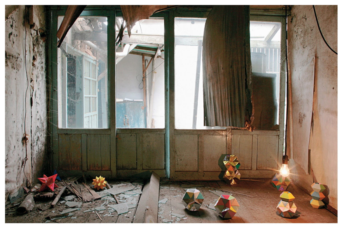
Yang's 2006 installation "Sadong 30," in an abandoned home in Incheon, South Korea. Haegue Yang, "Sadong 30," 2006, installation view, light bulbs, strobes, light chains, mirror, origami objects, drying rack, fabric, fan, viewing terrace, cooler, mineral-water bottles, chrysanthemums, garden Balsams, wooden bench, wall clock, fluorescent paint, woodpiles, spray paint, IV stand in an abandoned home in Incheon, South Korea, photo by Daenam Kim, image courtesy of the artist and Greene Naftali, New York

Today, Yang has made peace with the market. She is represented by galleries on three continents and her works are a ubiquitous presence at art fairs, where her larger pieces sell for six figures. "I keep losing my faith, but then I regain it," she said. The art world might be "vain" and "parasitic," but "at the same time, this is also often a shelter for so many minor voices" with "so much more tolerance that you cannot find anywhere else." This isn't to say she doesn't still come home "depressed" and "disgusted" from some of the obligatory social functions that come with the job, but she has also come to embrace her position within the industry, if somewhat ambivalently. "I want to be critical but at the same [time] I don't want to be someone who keeps complaining," she said.